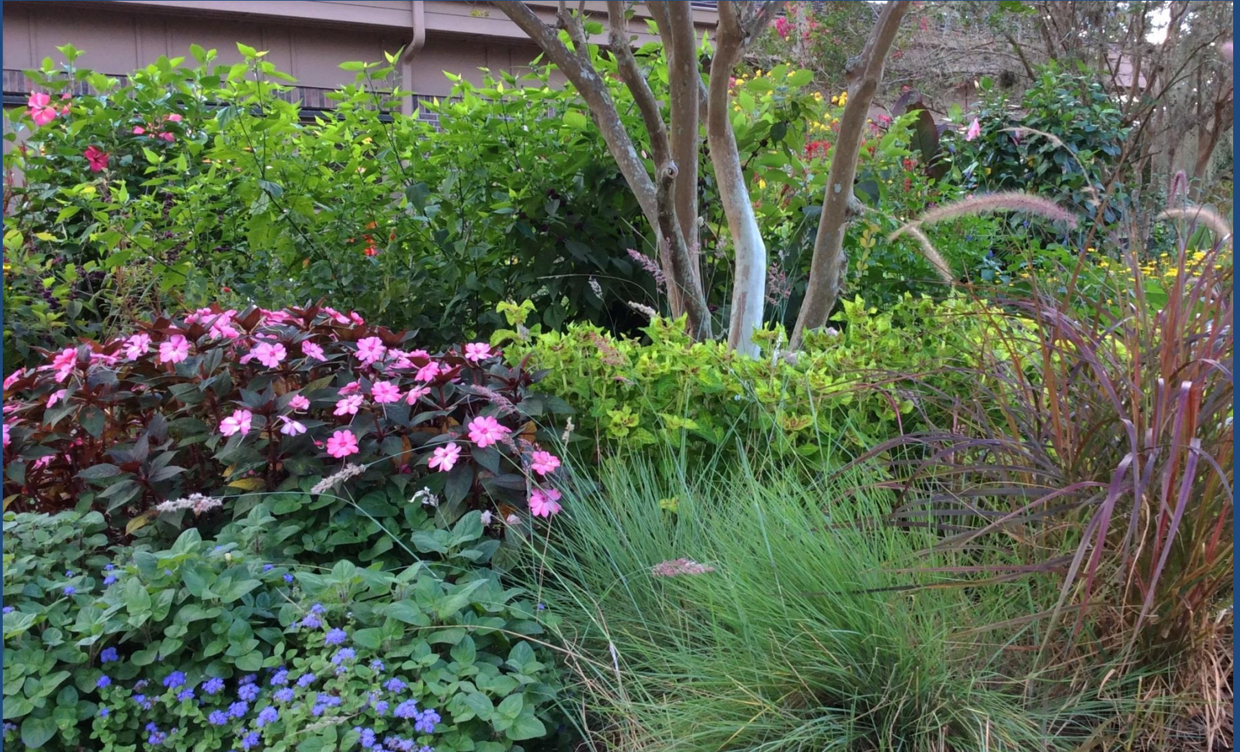
Melinis nerviglumis 'Savannah'