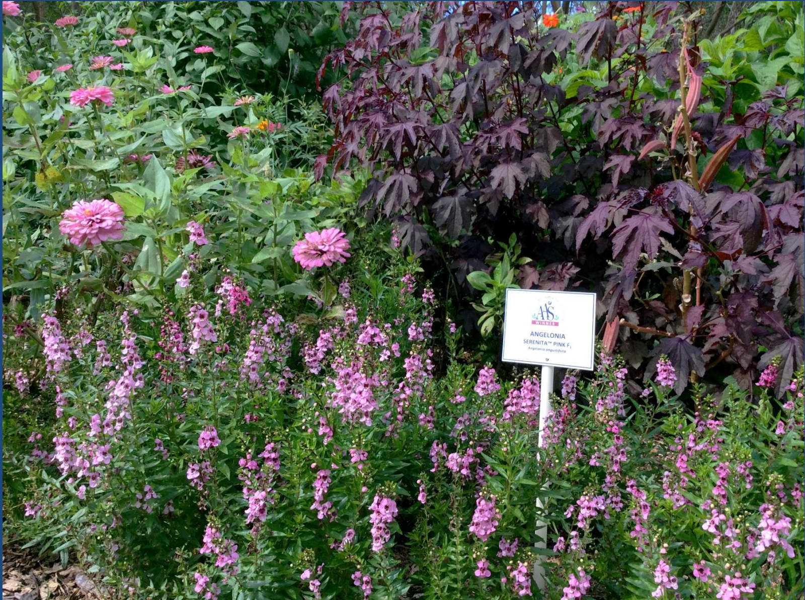
Angelonia angustifolia 'Serenita Pink'