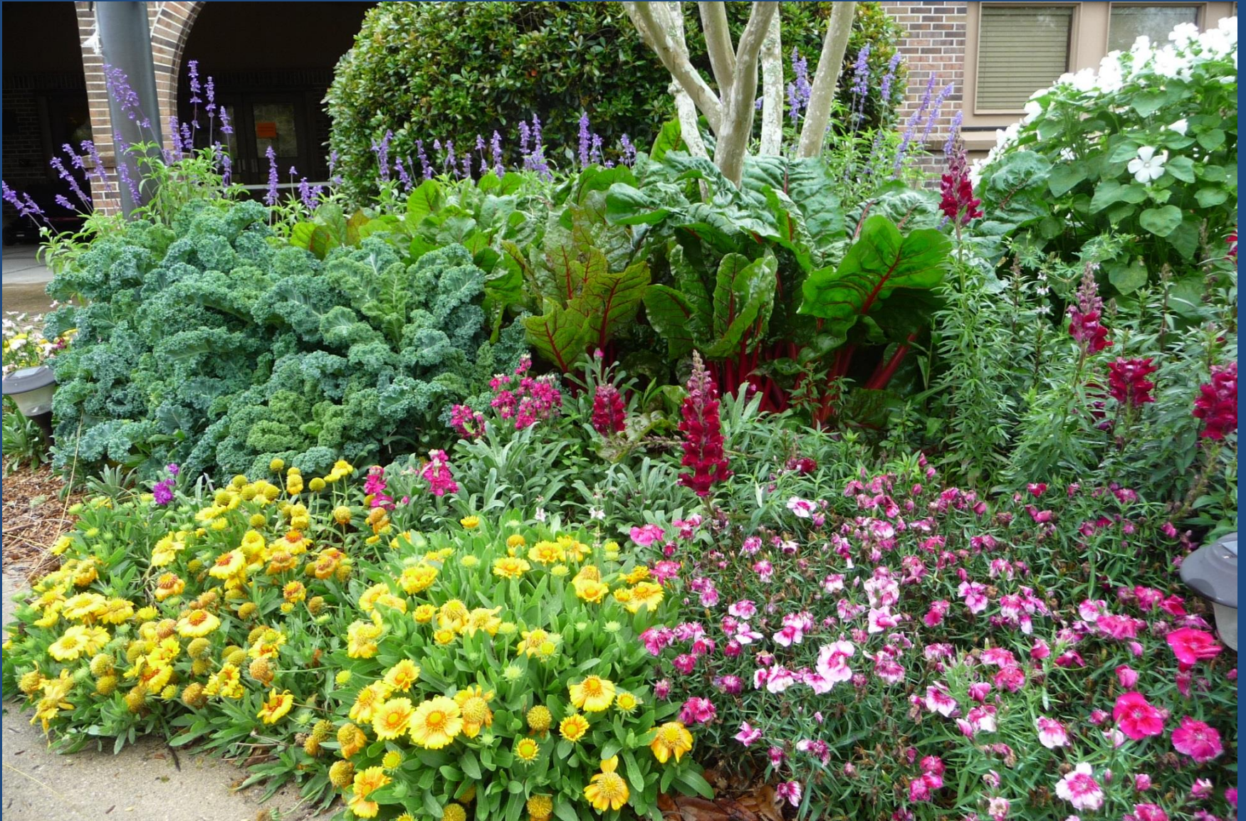
Kale 'Dwarf Scotch Blue' and Swiss Chard 'Ruby'