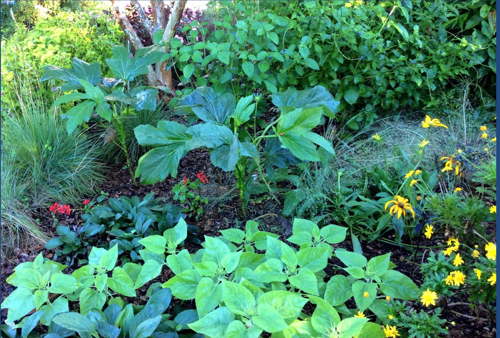
Okra 'Baby Bubba'