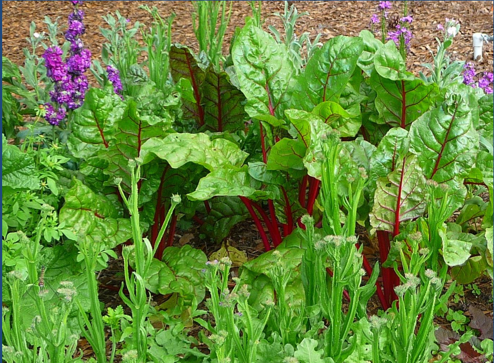
Swiss Chard 'Ruby'