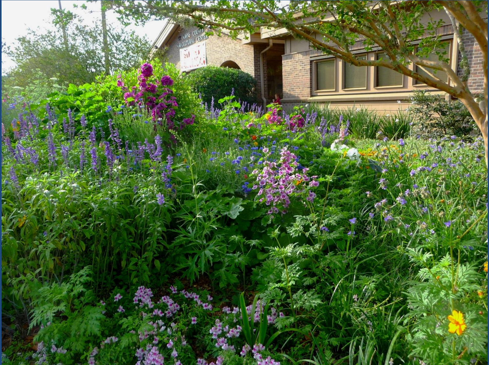
Sidewalk adjacent to the parking lot in front of the SJC Ag Center building