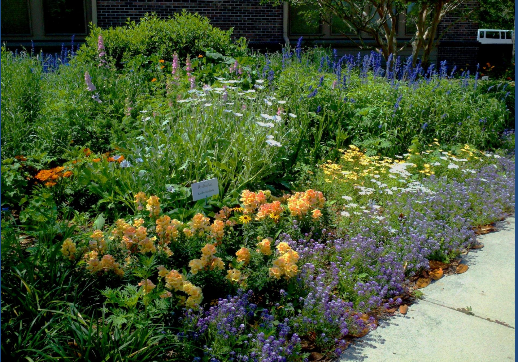
Sidewalk adjacent to the parking lot in front of the SJC Ag Center building