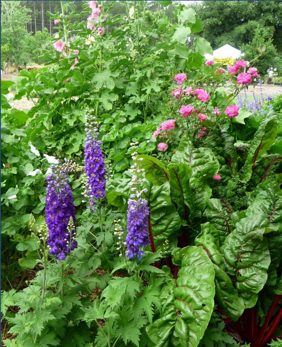
Delphinium x cultorum 'Tall Black Knight' April 21, 2012