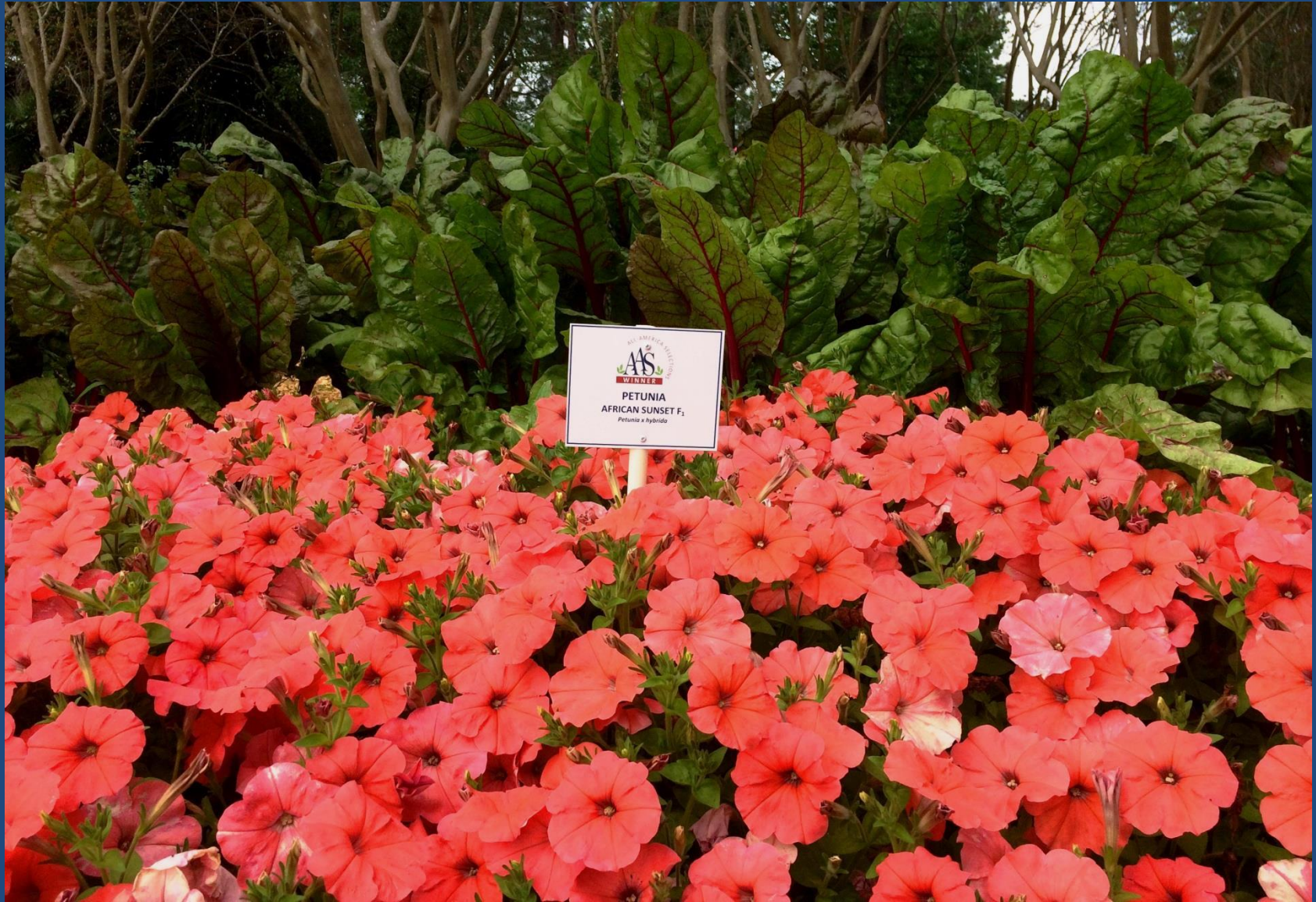
Petunia x hybrida 'African Sunset'