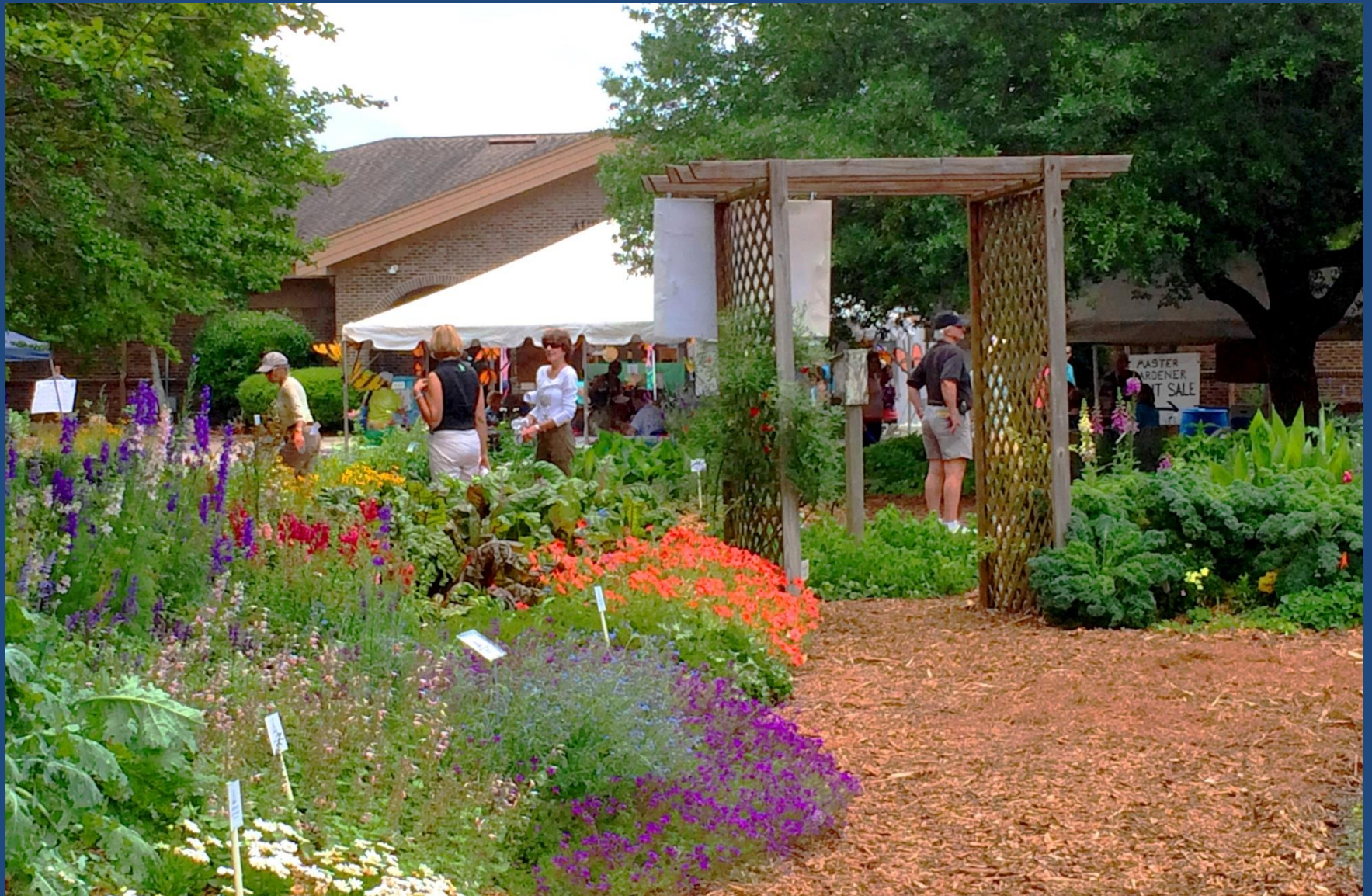
Visitors strolling through the gardens during the garden show