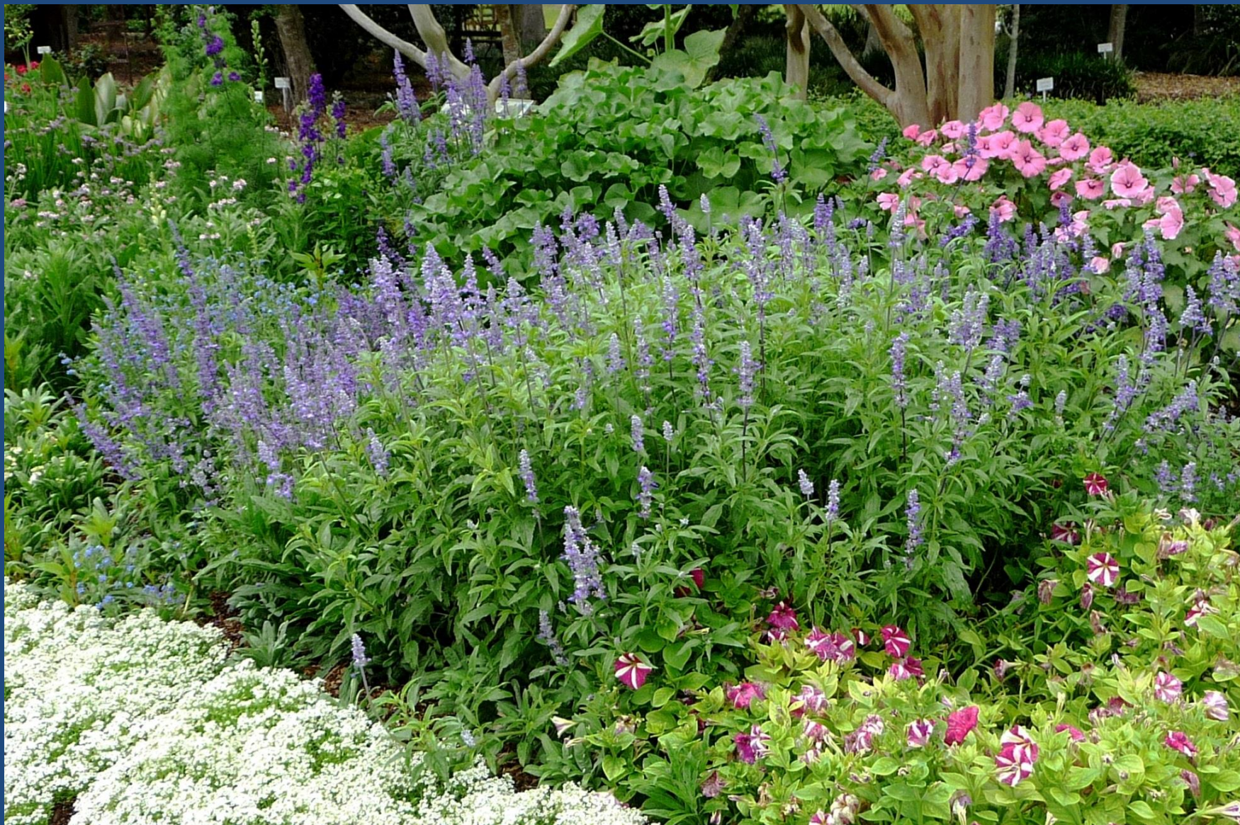
Sweet Alyssum 'Snow Crystals' Lavatera trimestris 'Silver Cup'