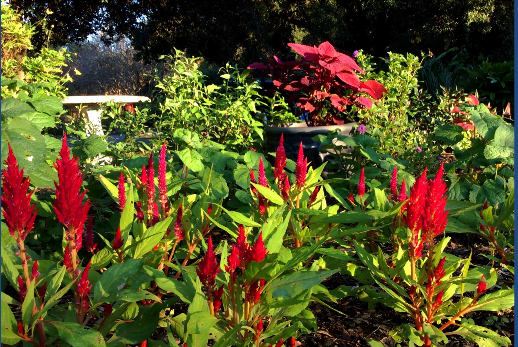
Celosia plumosa 'Fresh Look Red'