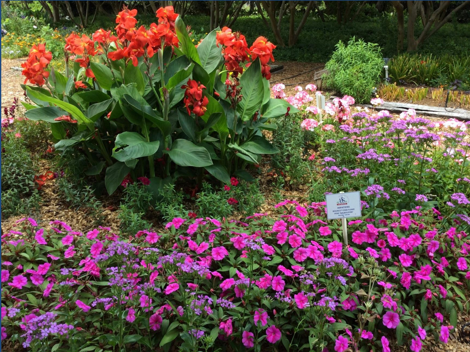
Canna 'South Pacific Scarlet' Impatiens interspecific 'Bounce™ Pink Flame' Geranium 'Pinto Premium White to Rose' May 14, 2015