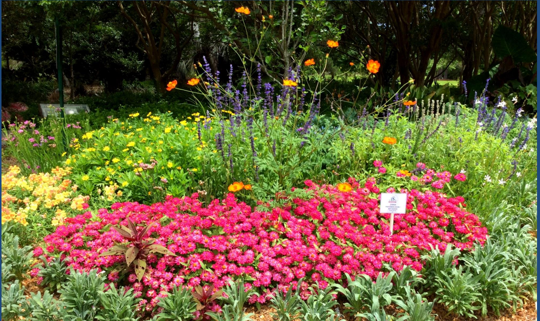
Zinnia 'Profusion Double Hot Cherry' Snapdragon 'Twinny Peach'