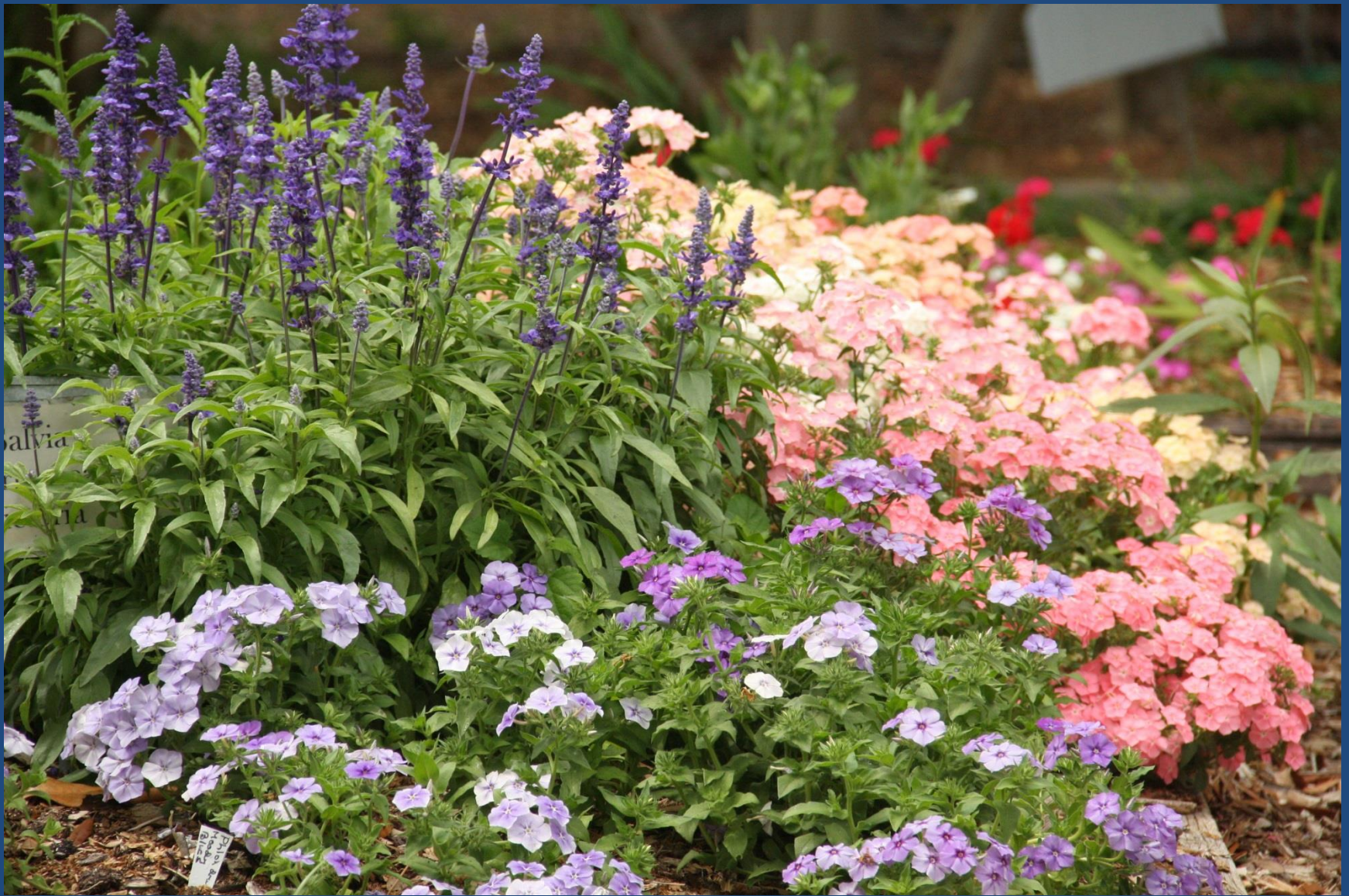
Salvia farinacea 'Blue Bedder' Phlox drummondii 'Moody Blues'