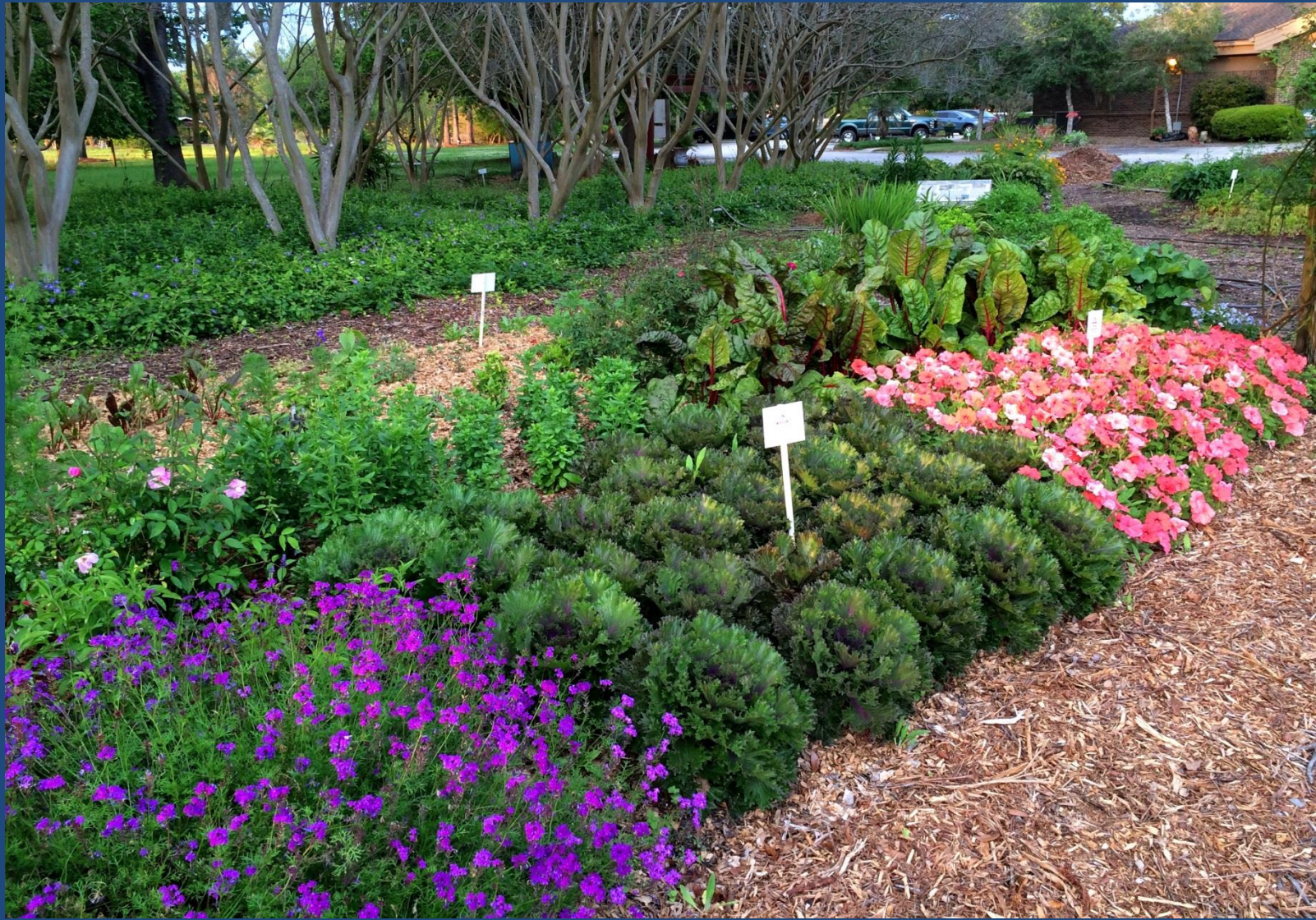
Verbena tenuisecta 'Imagination' Ornamental Kale 'Glamour Red'