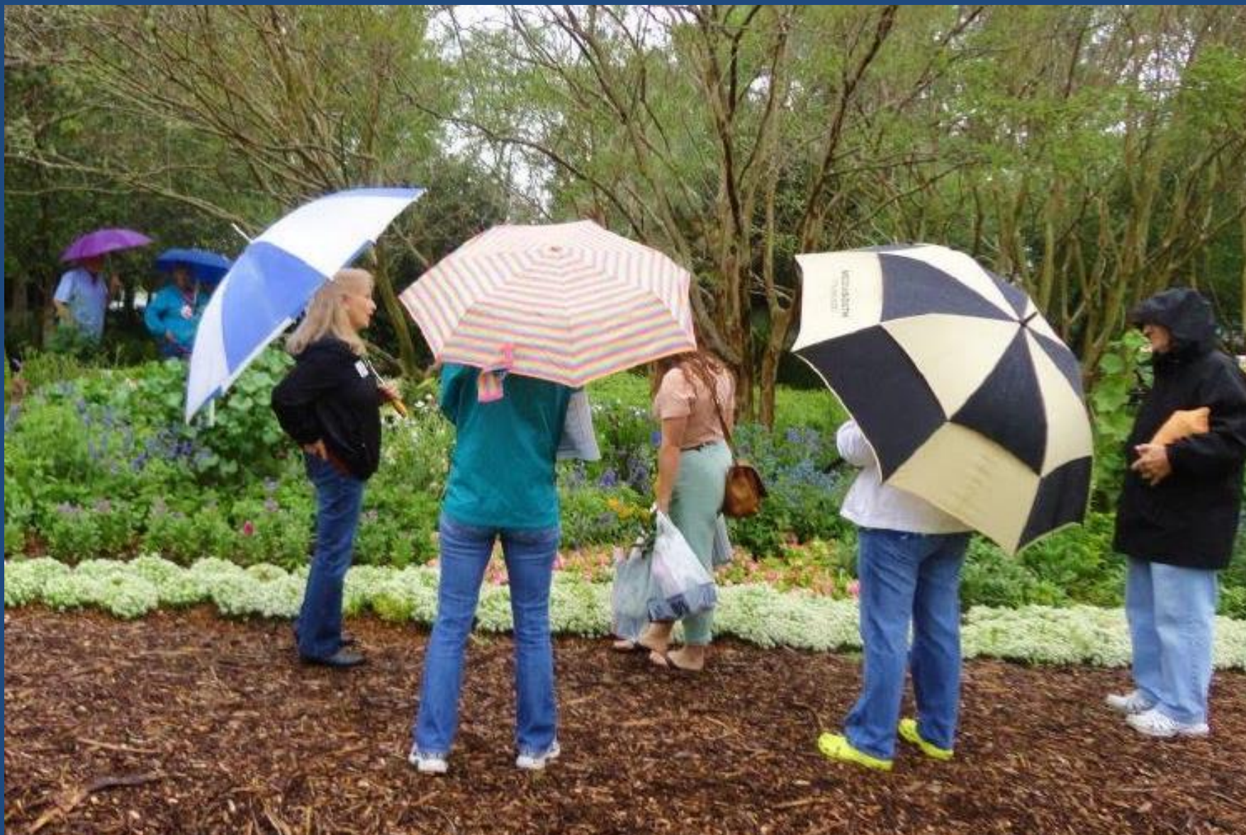
Visitors admiring flowers and asking questions