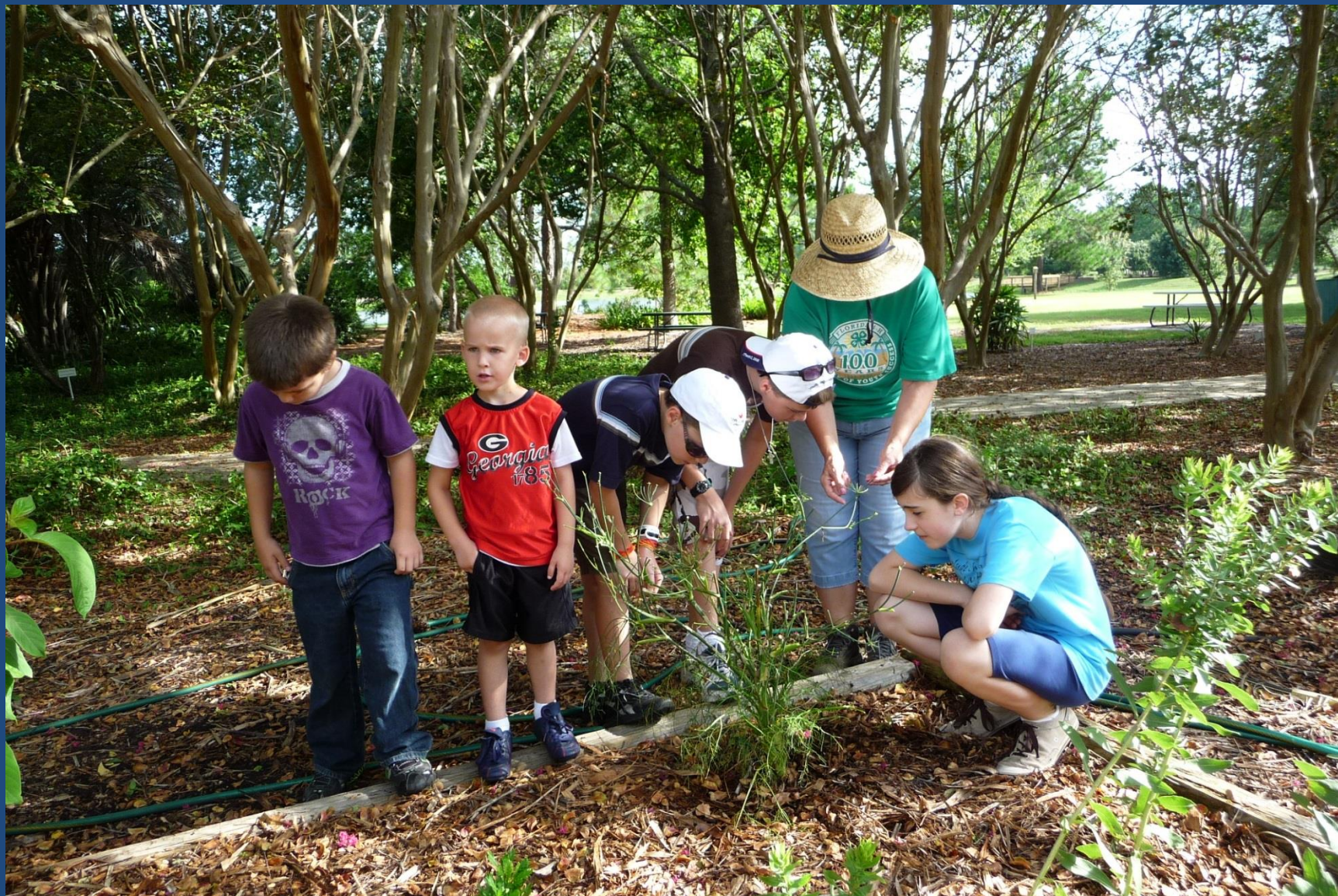
Children inspecting butterfly caterpillars on a fennel plant