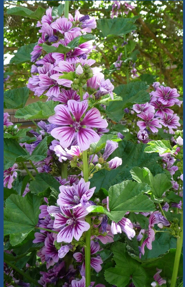
Malva sylvestris 'Zebrina' April 21, 2014