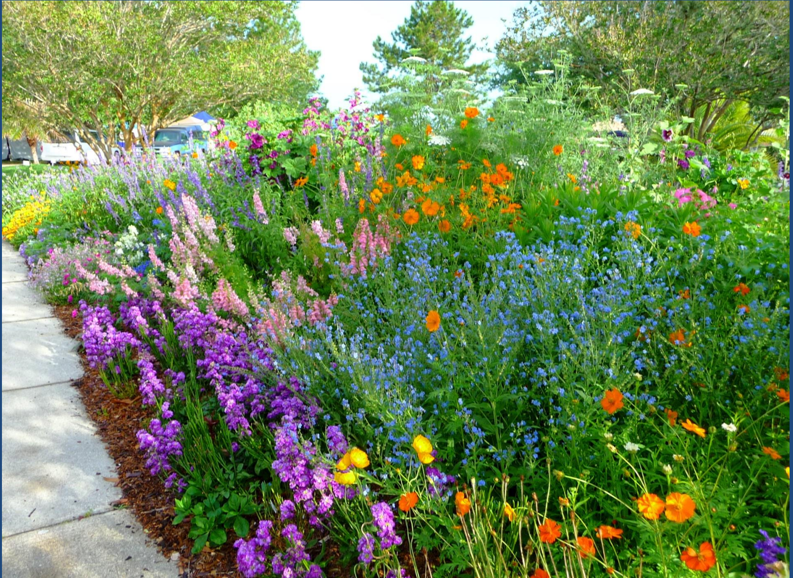
Sidewalk in front of the SJC Ag Center building (back side of previous slide)